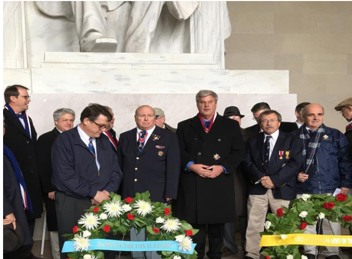
Laying wreaths at the Lincoln Monument during the Lincoln Birthday Celebration in Washington, D.C.